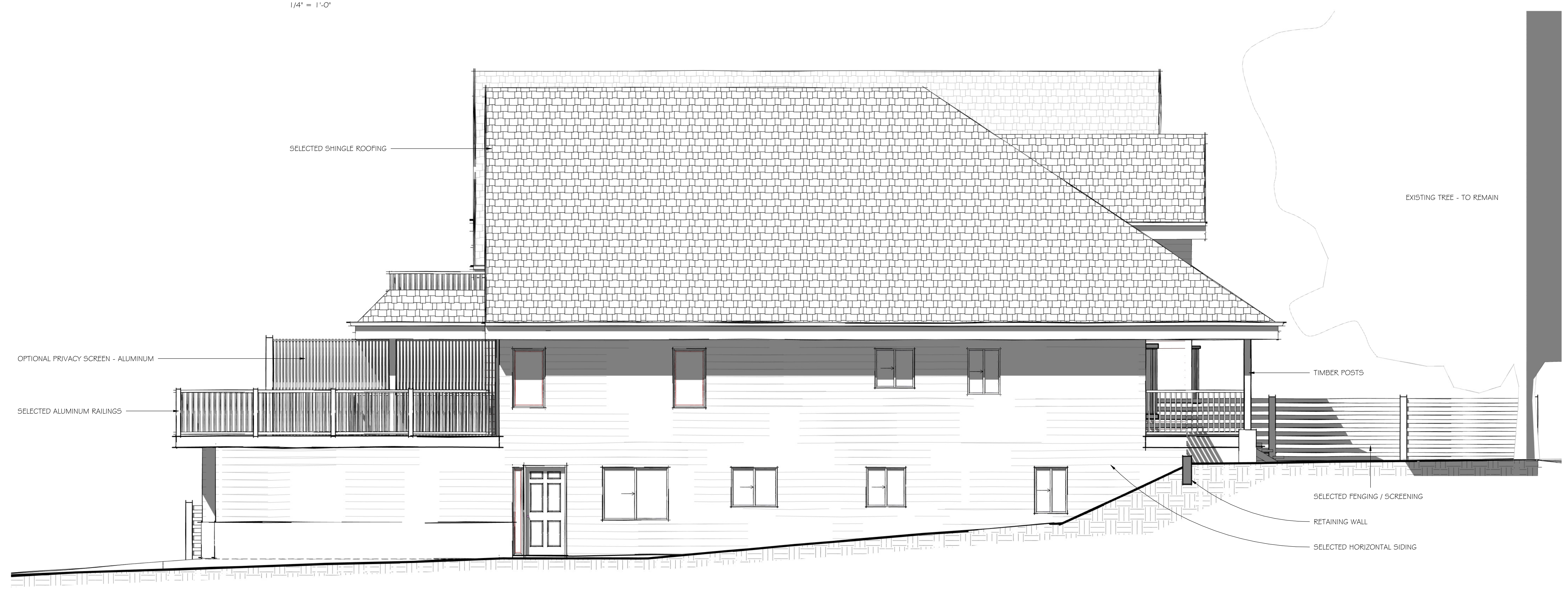
NORTH WEST ELEVATION 1/4" = 1'-0"